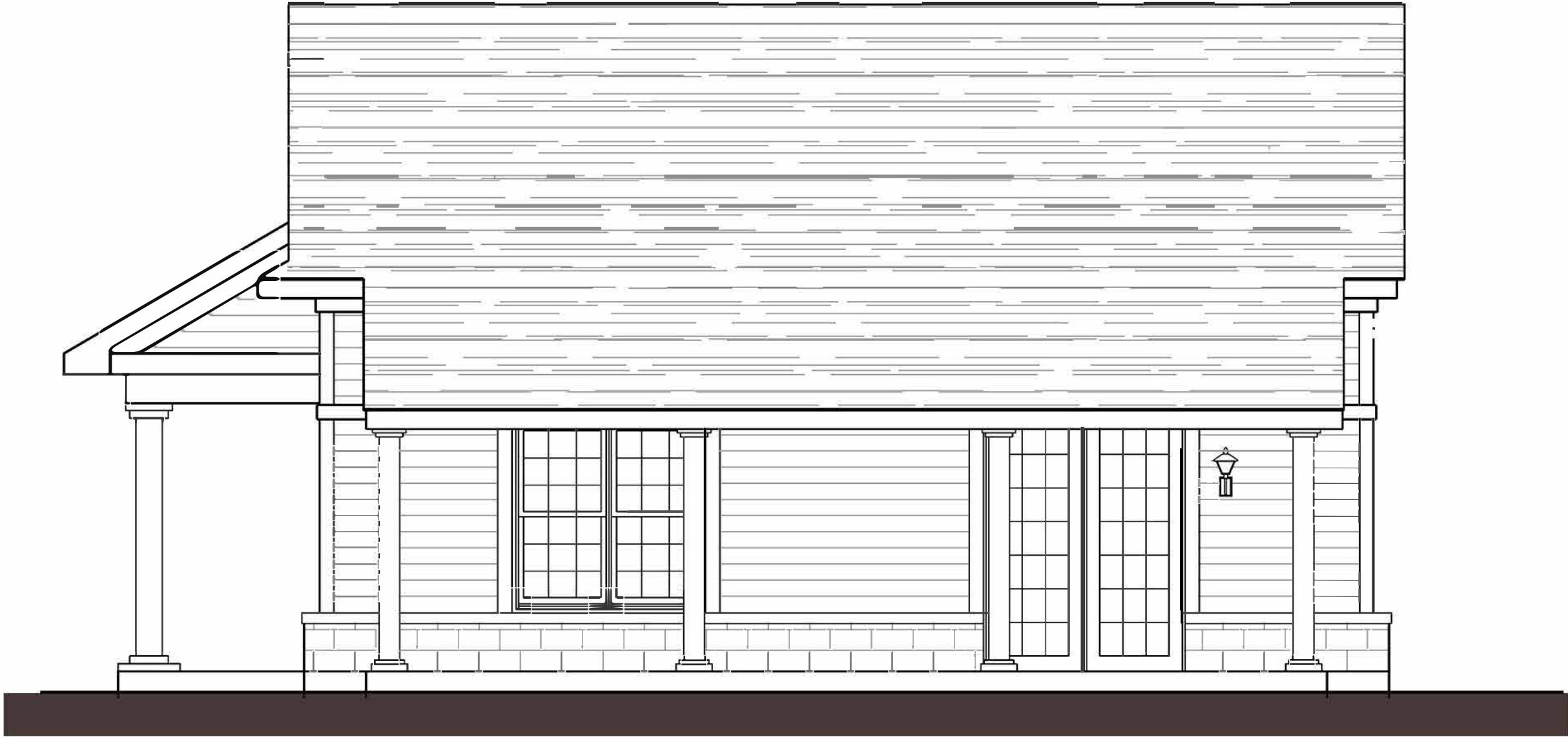
2 - RIGHT SIDE ELEVATION Scale: 1/4" = 1'-0"