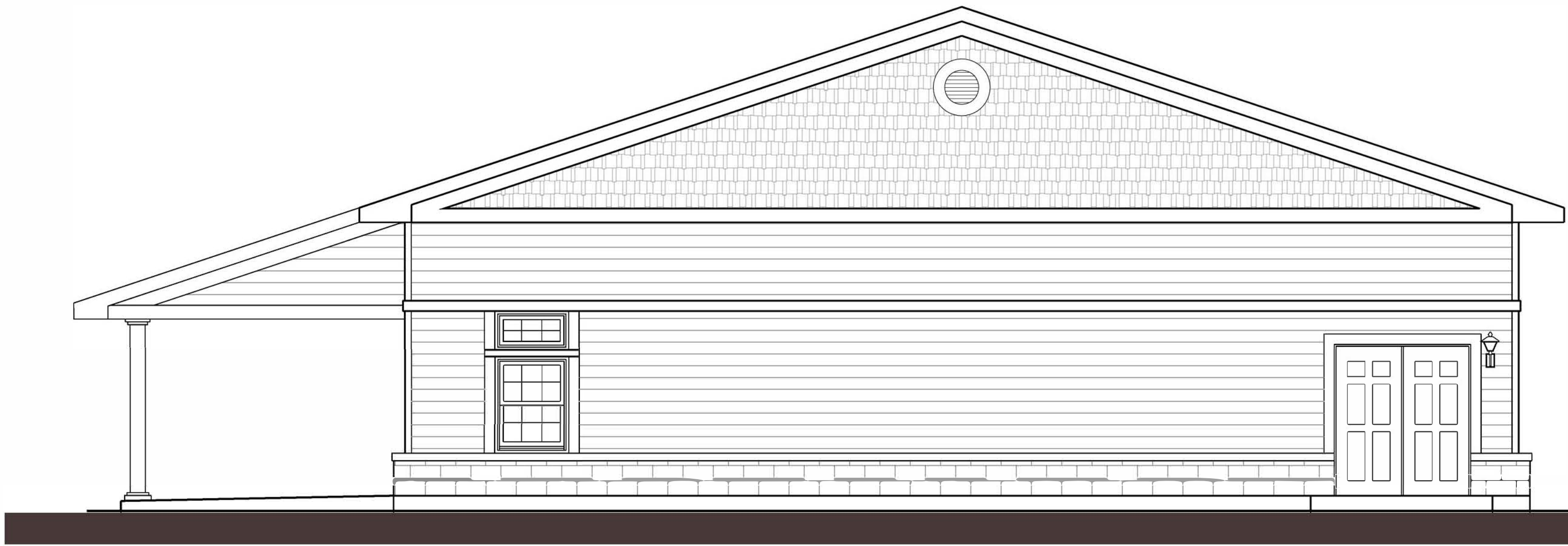
3 - REAR ELEVATION Scale: 1/4" = 1'-0"