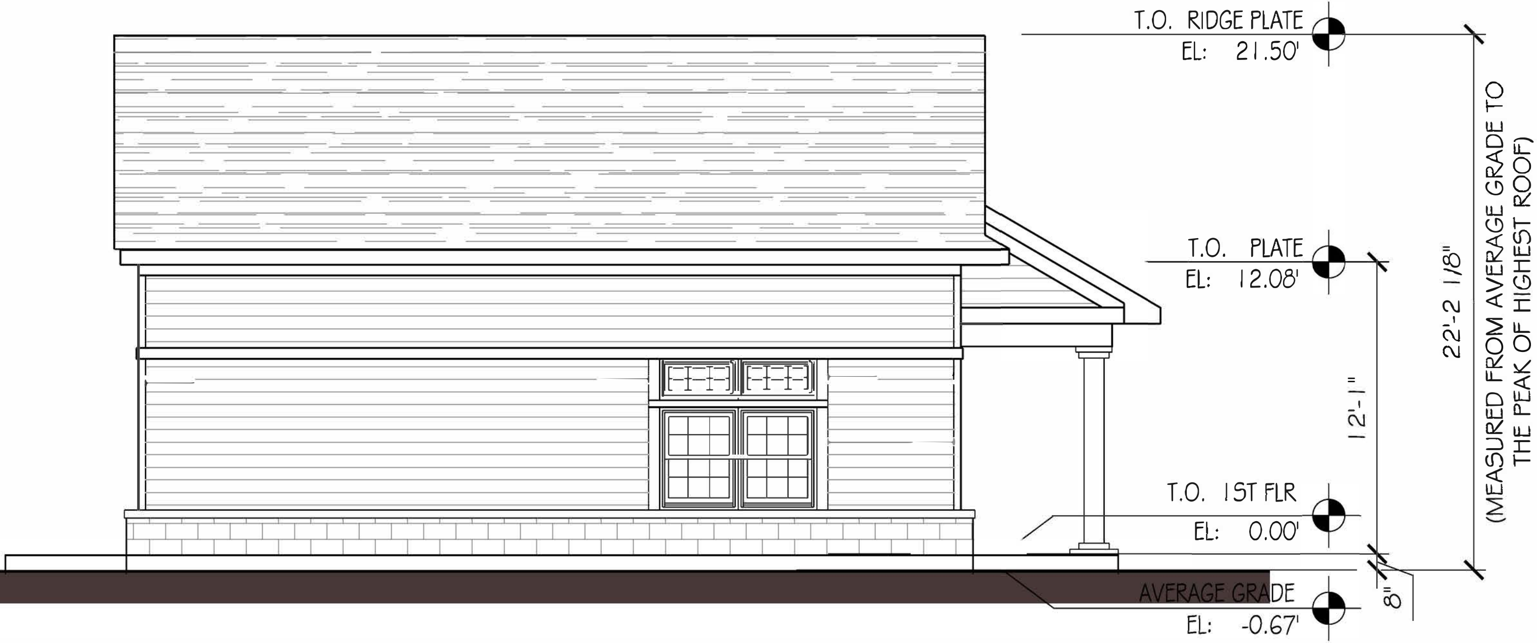
4 - LEFT SIDE ELEVATION Scale: 1/4" = 1'-0"